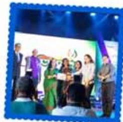
Family of Rotary