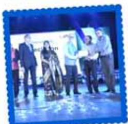
Peace & Conflict Resolution