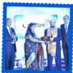
4 Individual rec